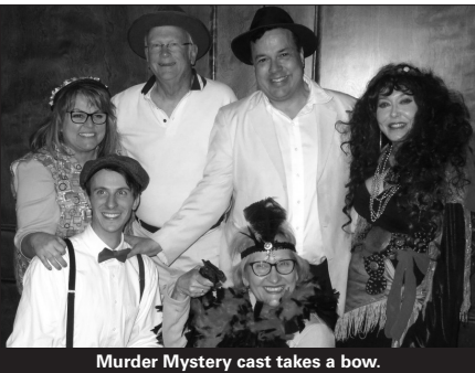
Murder Mystery cast takes a bow. Two of the performers are from our group