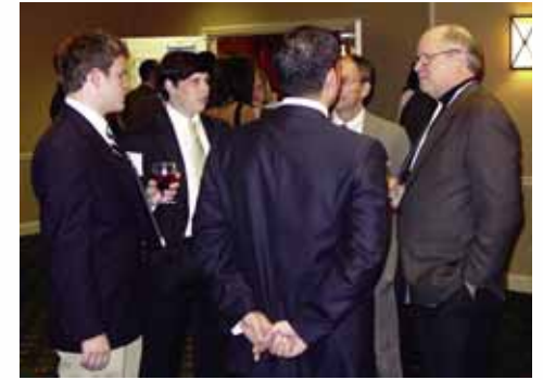
Students network with consultants at the opening reception of the conference.

A mentoring luncheon gave students a chance to interact with political consultants and network with people in their field of interest. Afterward, speakers talked about their career paths and gave advice on how to break into their field and succeed in the consulting business.