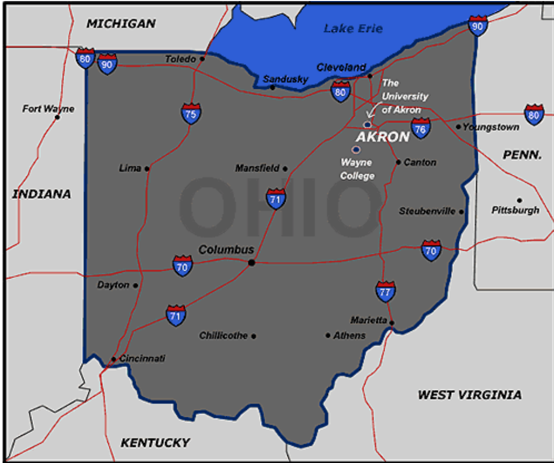
Map from www.uakron.edu/resources/campusMap/drivingDirections.php

Campus Directions: http://www.uakron.edu/resources/campusMap/drivingDirections.php