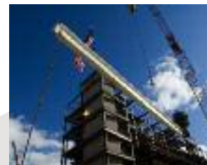
The signed beam is hoisted in place.

Despite the late hour, many fans remained after the game for an emotional ceremony honoring past Zips players and the stadium's history, followed by a thundering fireworks display that painted the night sky.