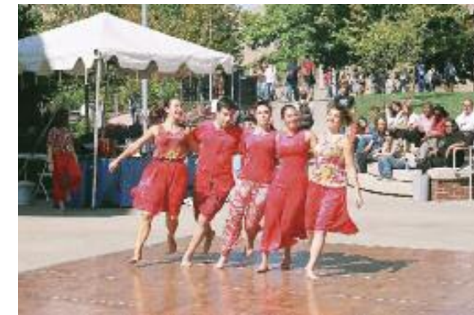
Student Appreciation Day Activities

some long-standing traditions, and some exciting new opportunities that were not to be missed.