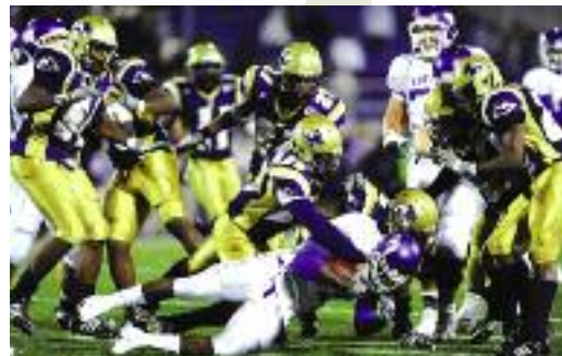
UA Zips battle Buffalo in the last game at the Rubber Bowl Nov. 13, 2008.