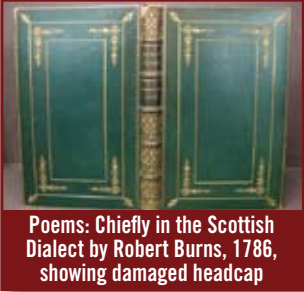
Poems: Chiefly in the Scottish Dialect by Robert Burns, 1786, showing damaged headcap