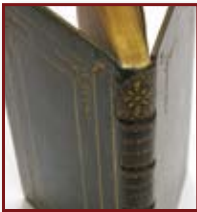
Photograph showing repaired headcap

Funds are being sought for conservation work on the post-1800 imprints. In 2008, every volume in this collection was placed in a custom-made phase box for preservation purposes, and records for each title were added to the online catalog.