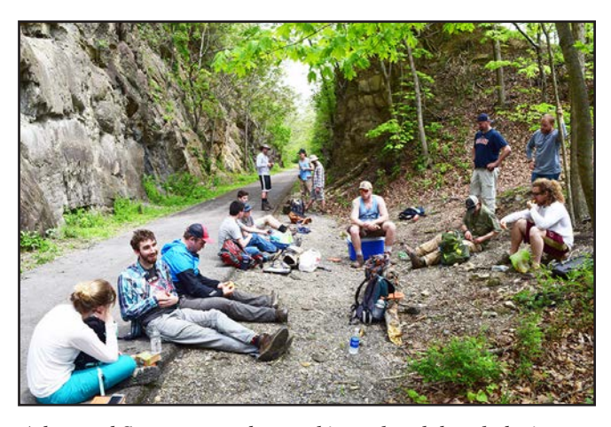
Advanced Structure students taking a lunch break during field trip to analyze folded rocks in Hancock MD, 2017.