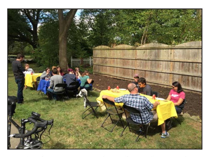
A perfect day for a picnic in the sunshine, relaxing, making memories with good food and good friends!