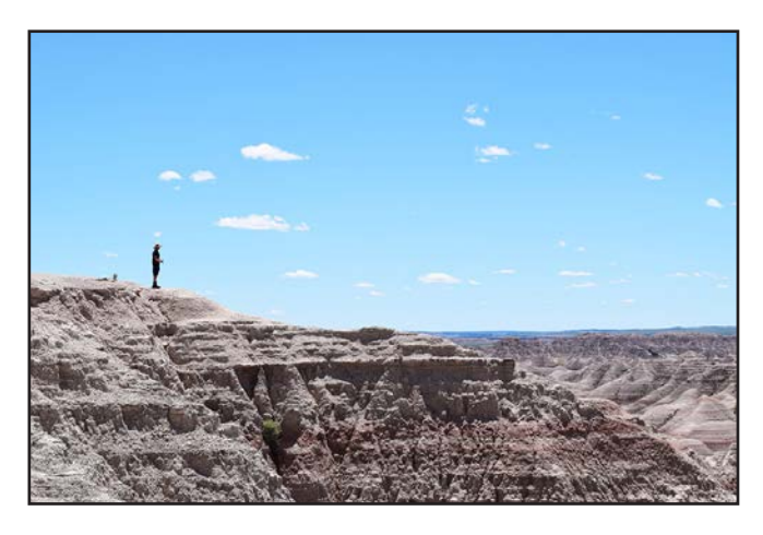
Graduate Student RJ McGinnis contemplating the need for proper hydration at Badlands National Park, South Dakota, June 2017.