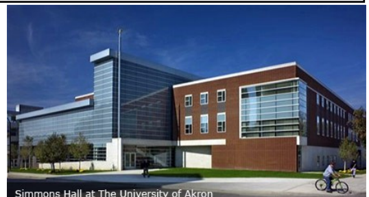
Simmons Hall at The University of Akron

Fall & Spring Office Hours: Monday, Tuesday, Thursday, & Friday 8 a.m.-5 p.m. Wednesday: 8 a.m.-7 p.m.