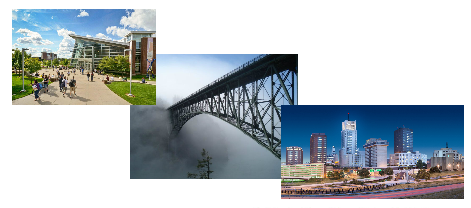
The University of Akron - College of Business Administration