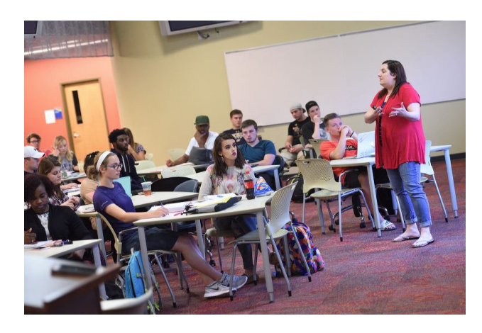
The University of Akron - College of Business Administration