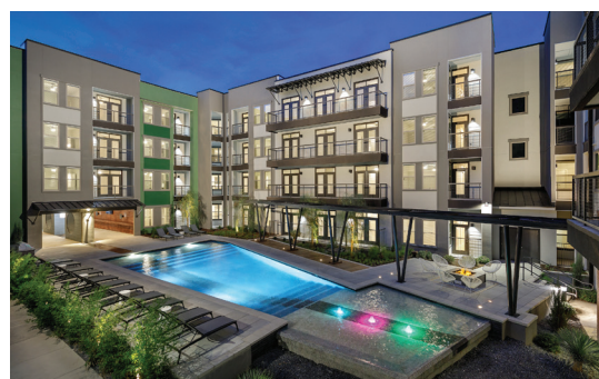
THE BALDWIN ST PAUL SQUARE SAN ANTONIO, TX