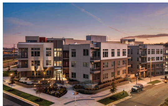
THE PARKWOOD AT OPTIMIST PARK CHARLOTTE, NC