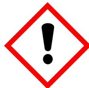
IRRITANT / HARMFUL

Skin sensitizer, Eye irritant, Respiratory irritant, Harmful if swallowed